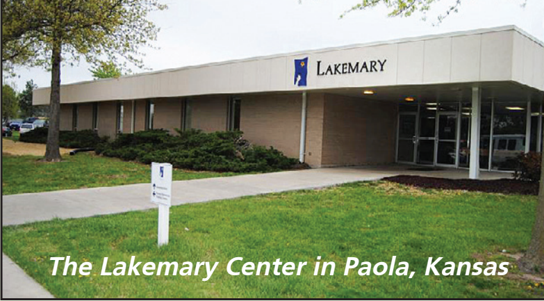
The Lakemary Center in Paola, Kansas